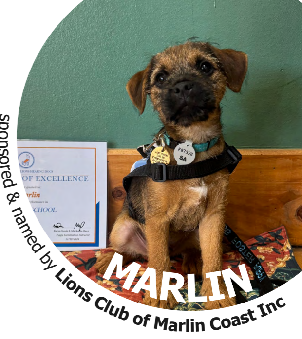
sponsored & named by Lions Club of Marlin Coast Inc