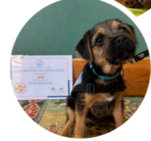
Mitty Sponsored and lovingly named by the Lions Club of Millmerran Inc