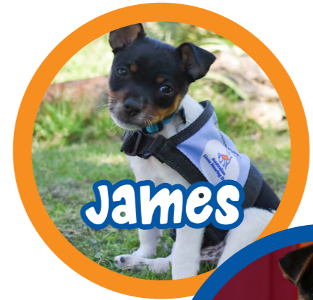
Sponsored and named by Suzanne