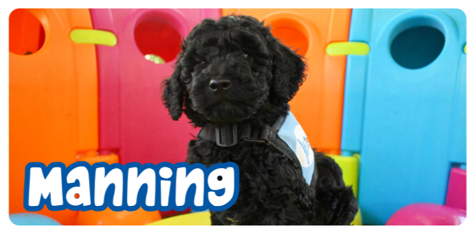
Manning Sponsored and named by Lions District 201N1 Zone 6 Clubs