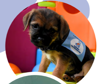
Archie Sponsored and thoughtfully named by the Lions Club of West Beach Inc