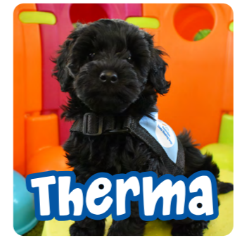
Therma Sponsored and named by Lions Club of Berri Inc