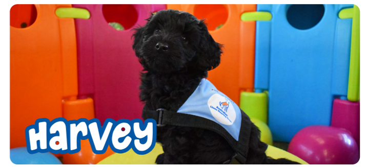
Harvey Sponsored and named by Lions Club of Townsville Cleveland Bay Inc