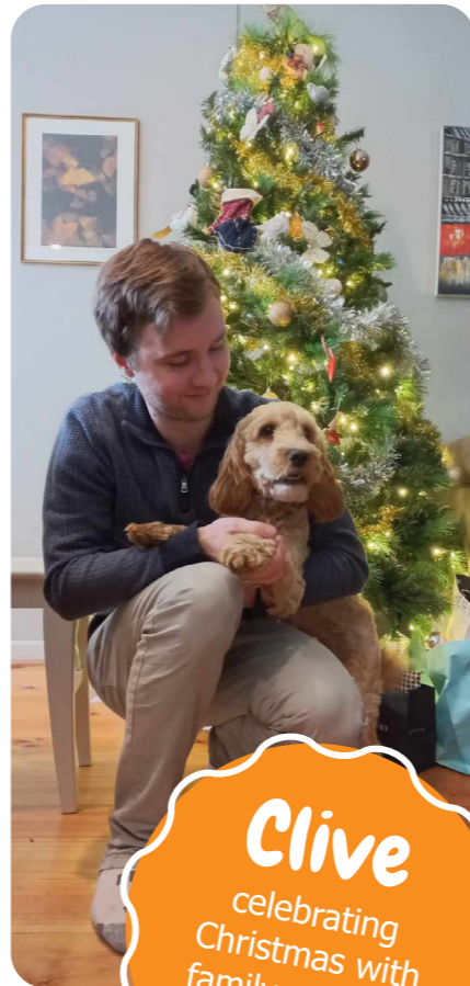
Clive celebrating Christmas with family member Reuben!

Clive has a mischievous side—he often indulges in playful antics like pulling the cotton out of his toys. When caught in the act, he cheekily dashes away, carrying his toys in his mouth. There have been occasions when we've come home to find fluffy remnants of his toys scattered about, evidence of his crime!